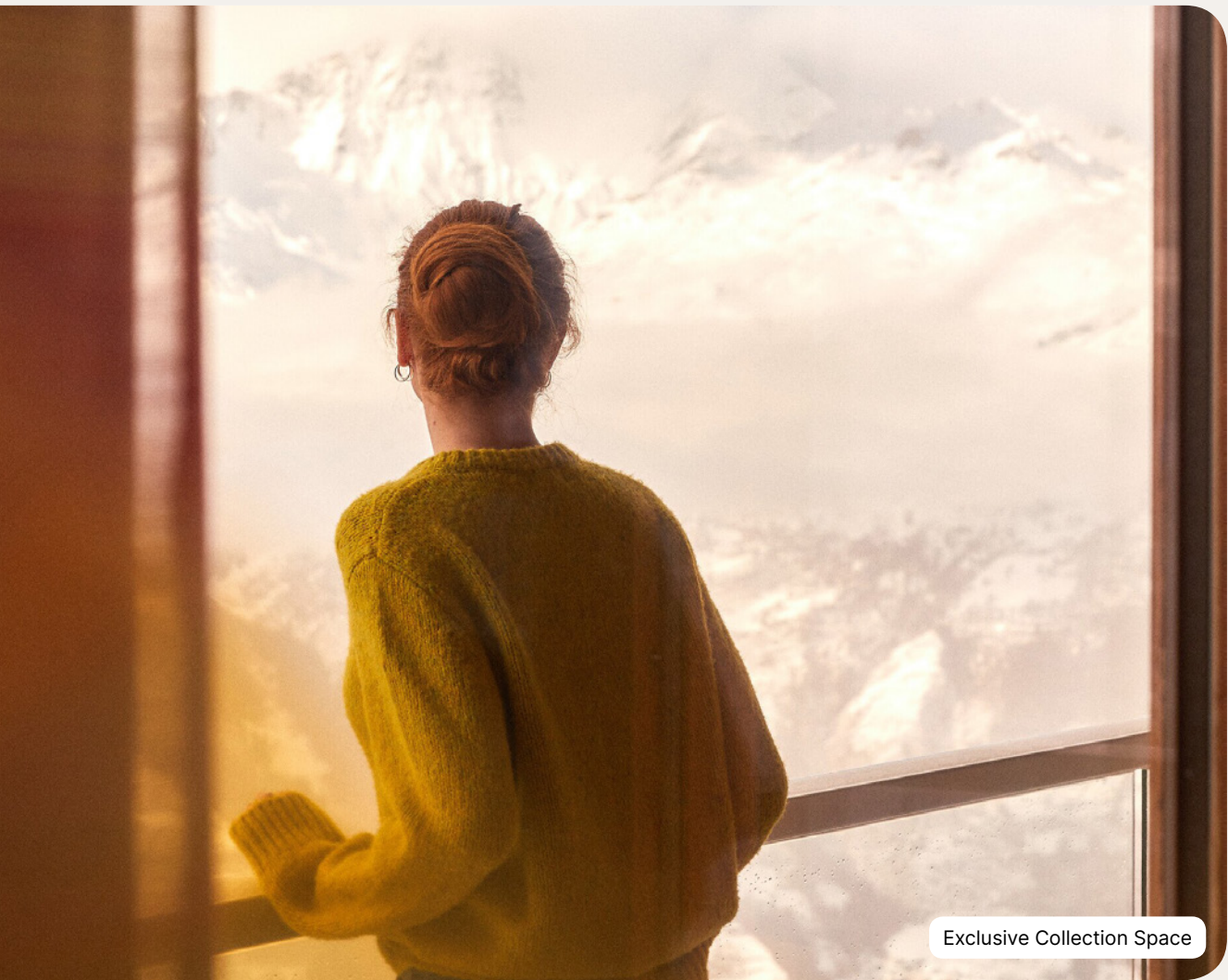
Exclusive Collection Space