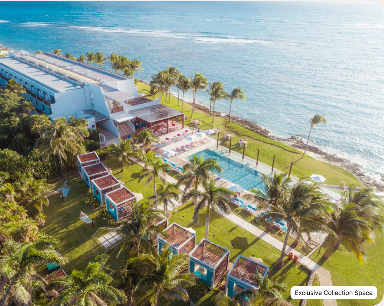
Exclusive Collection Space