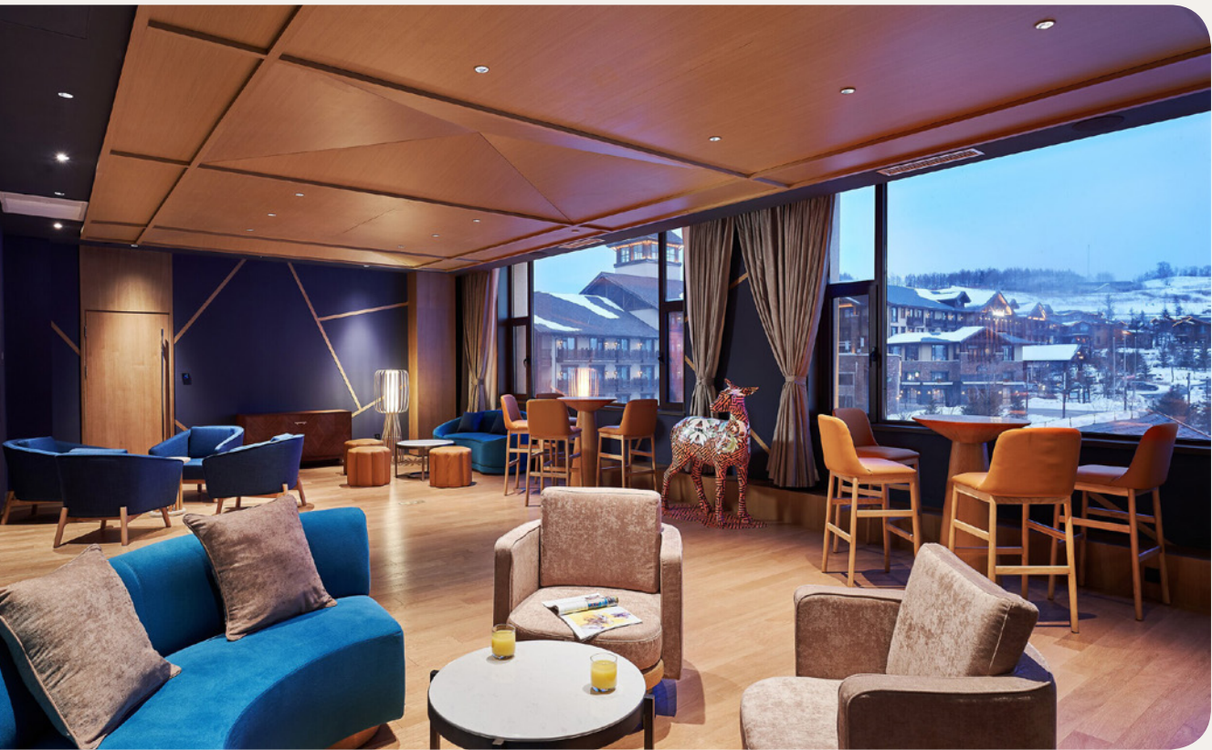
Bars White Rivers Bar Main bar