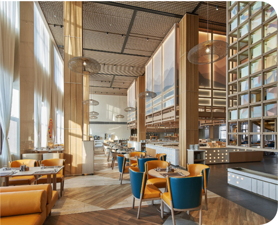
Heaven Lake Restaurant Main Restaurant

Delight in à la minute dishes that blend international flavours with regional specialties infused with invigorating ginseng, like our signature dish, Ginseng Chicken Soup. In this elegant buffet-style restaurant, the décor pays tribute to the majestic volcanic landscapes of Tianchi.