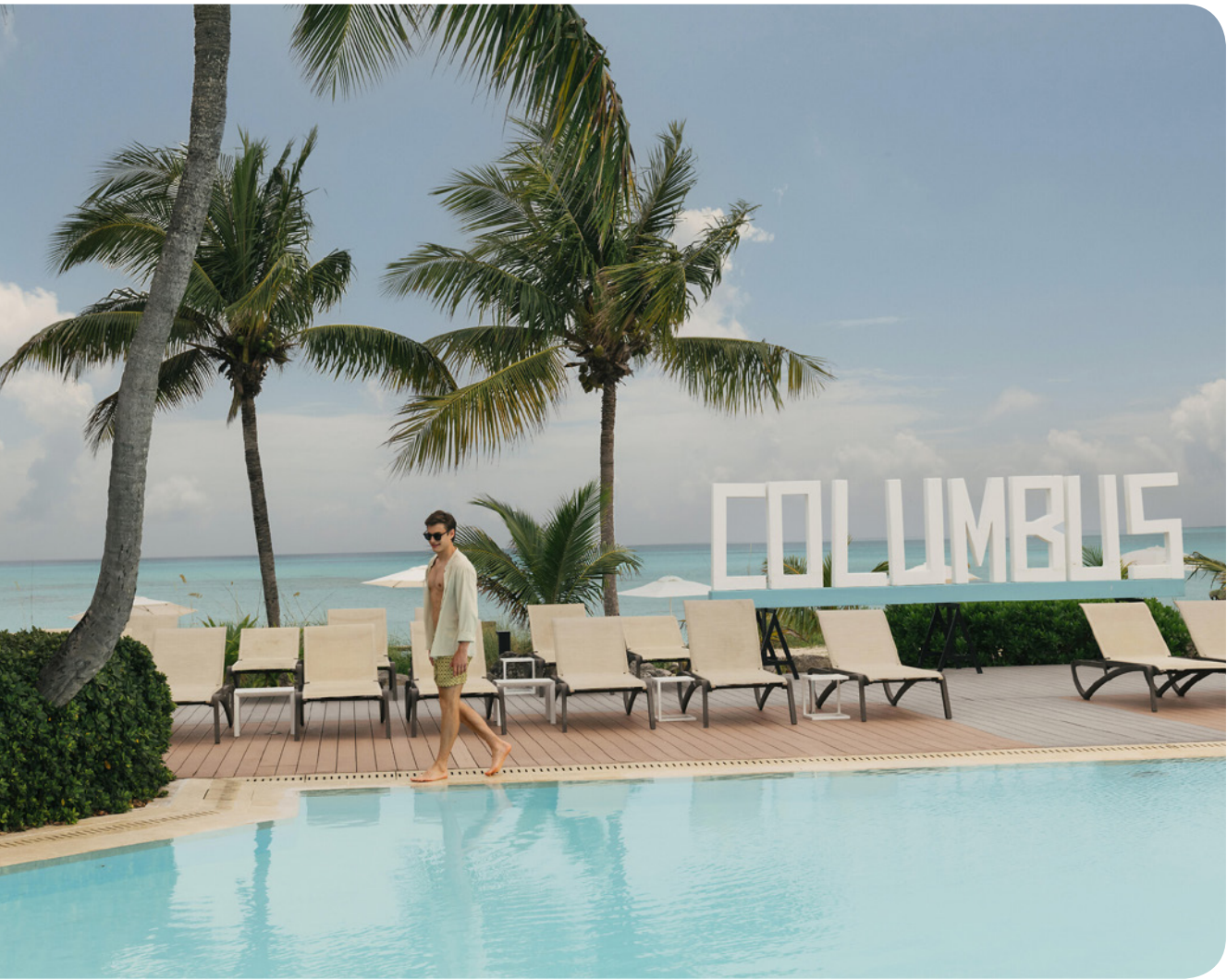
Swimming pool Outdoor pool