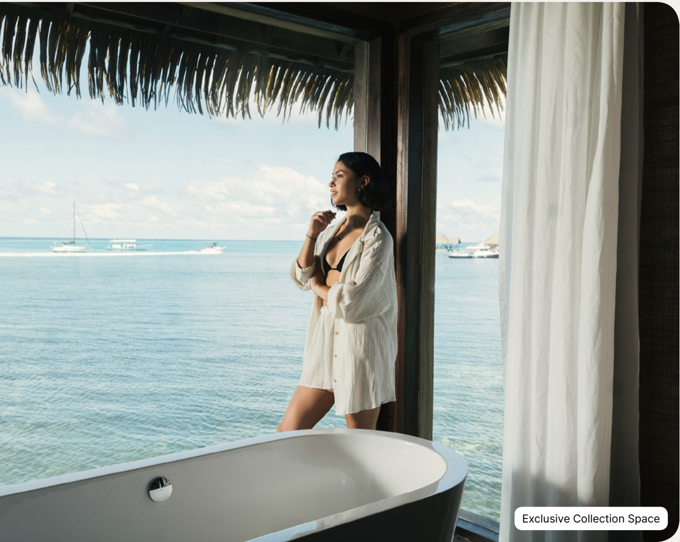
Exclusive Collection Space