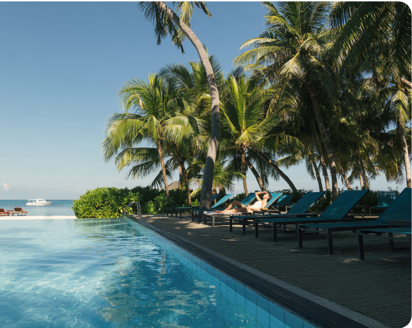
Main swimming pool Outdoor pool