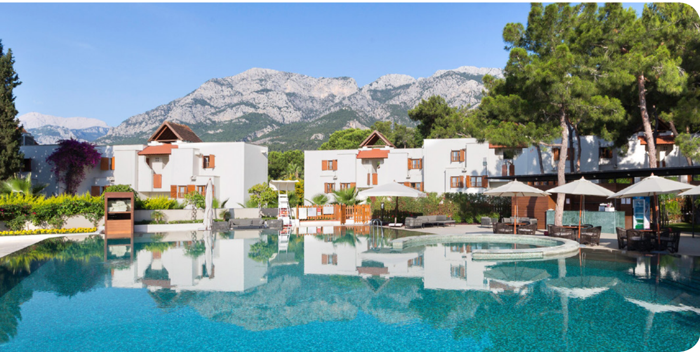
Main swimming pool Villagio Outdoor pool