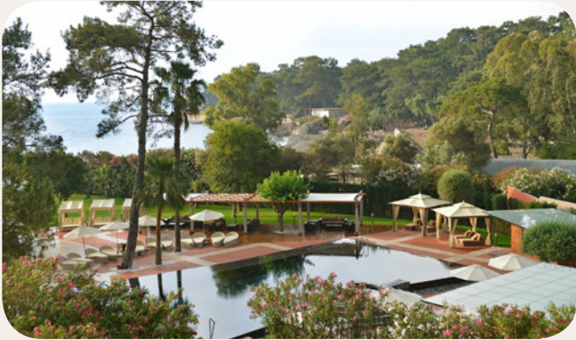
Zen Pool Hotel Outdoor pool

This freshwater pool with hot tub near the hotel welcomes you throughout the day. Access only for adults over 18. Supervised between 10 am and 6 pm. Heated – At the beginning and end of the season, depending on weather conditions.