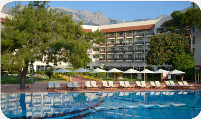
Outdoor hotel pool Outdoor pool

This fresh water overflow pool is located in the hotel, with a shallow-end area for kids. Supervised between 10 am and 6 pm. Children are under the supervision of their parents or an accompanying adult. Heated – At the beginning and end of the season, depending on weather conditions.