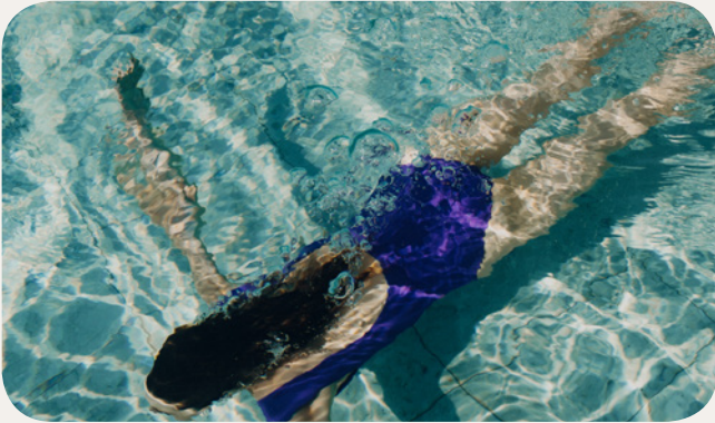
Indoor Pool Indoor pool

Available from Resort opening until May 1st, then from October 1st to Resort closing. Freshwater pool reserved for adults and close to the hotel Spa. Depth (min./max.): 5.577428m / 5.577428m