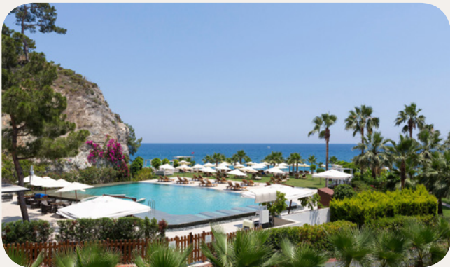
Zen Pool Villagio Outdoor pool

Located alongside the beach, near the waterskiing area and not far from the children's club facilities, this pool is reserved for adults. Heated – At the beginning and end of the season, depending on weather conditions.