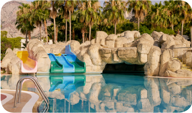
Children’s swimming pool Outdoor pool

At Baby Club Med, Petit Club Med and Mini Club Med, your children can have fun in the paddling pool and shallow pool. Young G.Ms love cooling off in the water, whether they are playing games, trying sports or simply relaxing. Heated – At the beginning and end of the season, depending on weather conditions.